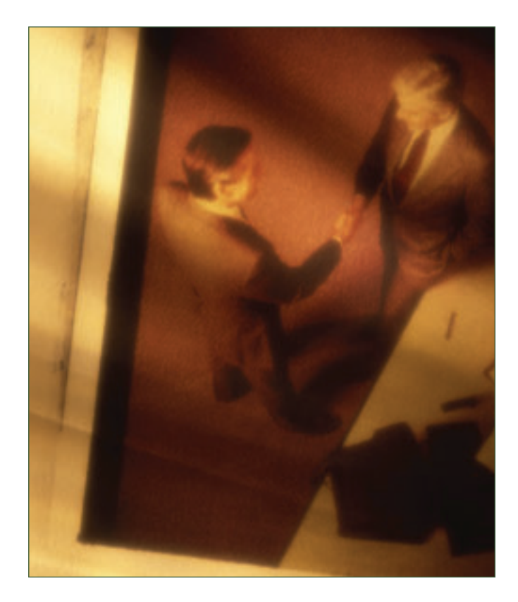
Drafting an Enforceable Pledge

If the charity does not intend to sue the donor, why make the pledge enforceable? Often, the charity believes that there is no harm in making the pledge enforceable, and that perhaps it will help with collection even if the charity never intends to sue the donor. This article explores both the harm and benefit that may arise from enforceable pledge agreements, and reviews the many issues that should be considered in drafting an enforceable agreement that serves both the donor and the charity.